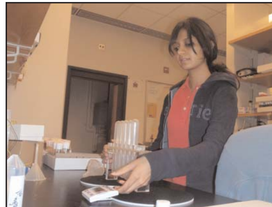
The Institute On Neuroscience (ION) program introduces high school students to research taking place in Atlanta’s neuroscience laboratories.