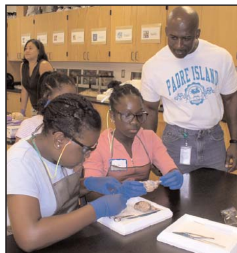
Sheep brain and cow eye dissection, along with sensory perception experiments are just a few of the fun, hands-on activities designed for middle school students who participate in Brain Camp for Kids.